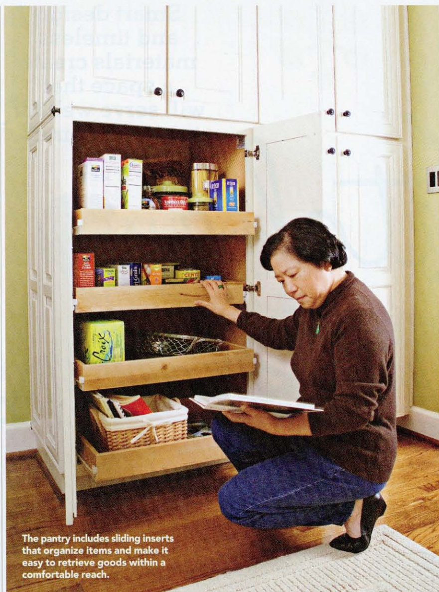
The pantry includes sliding inserts that organize items and make it easy to retrieve goods within a comfortable reach.